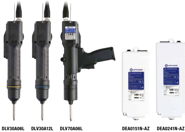
DLV30A06L DLV30A12L DLV70A06L