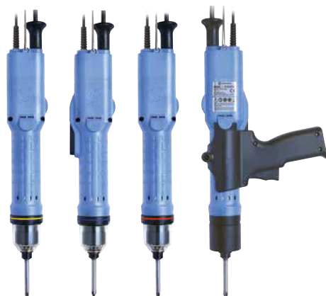
DLV30A06P-SP DLV30A12L-SP DLV30A20P-SP DLV45A06L-SP/DLV45A12L-SP/DLV70A06L-SP