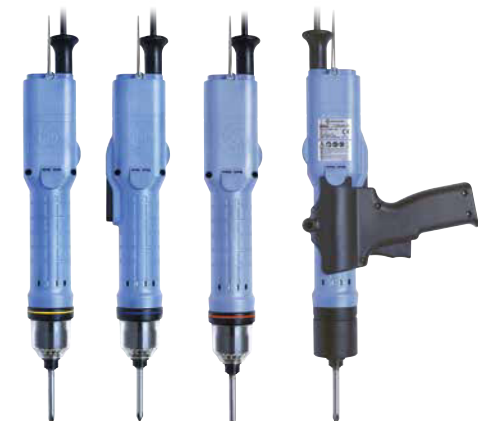
DLV30A06P-AB DLV30A12L-AB DLV30A20P-AB DLV45A12L-AB